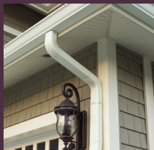
Rainware, Fascia, Soffit