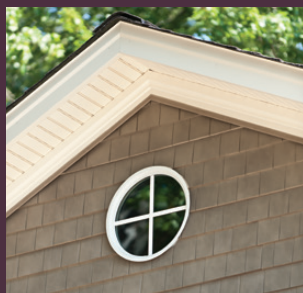
Vinyl Siding and Accent Panels

From corners to trim, guttering to soffits, door surrounds to fascia, Variform has all the details you need to define the look you want for your home. And with our enhancements — Leaf Relief® by Ply Gem gutter protection, Ply Gem Stone, Ply Gem Trim and Mouldings and Ply Gem Shutters and Accents — you'll enjoy worry-free maintenance and a beautiful finish down to the last detail.