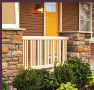
Ply Gem Fence and Railing