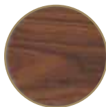
Colonial Cherry Woodgrain*