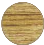
Golden Oak Woodgrain*