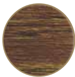
Natural Oak Woodgrain*